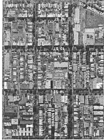
01 VICINITY PLAN SCALE: 1" = 300'