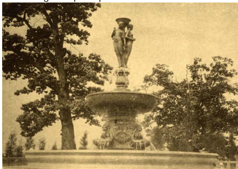
McMillan Fountain, Herbert Adams, sculptor