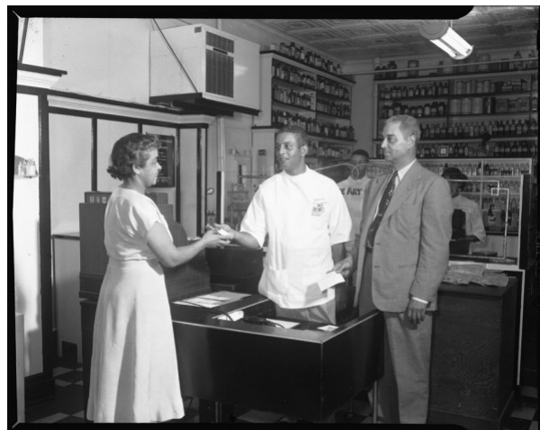
"Ethical Pharmacy" once at 518 Florida Ave., ca. 1950